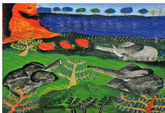
Figure 2 Opening 2 of The Real Elephant (Yusof Gajah, 2011)

Character attribution meaning system helps to describe and highlight characters’ external appearance. The main character in RE is an elephant and it is introduced to the readers in opening 2. The visual shows three elephants, who are similar in size, colour and shape, standing together (refer to Figure 2). Textually, the elephant is not ascribed any attributes. In opening 3, the main character is introduced exclusively in the visual. It is positioned in the centre of the page and in terms of size, it looks huge. Its facial features, however, looks odd because the elephant has yellow eyes with red sclera and yellow tusks. Clearly, the visual in Opening 3 contributes pertinent details in terms of changes in the elephant’s physical attributes. The weirdly coloured facial features may also indicate a twist in the storyline. In the next few openings, the elephant’s appearance changes extensively as it goes through various physical alterations and transforms into different types of animals. The use of colours and features in the visuals clearly illustrate each transformation and the changes in the elephant’s external appearance. However, the character attributes assigned to describe the elephant’s appearance in the written text are minimal as only nominal groups like ‘a bird, a fish’ or a dragon’ are used or intensive attributes like ‘very strange’ or ‘unusual looking’ are used to describe the elephant’s transformations.