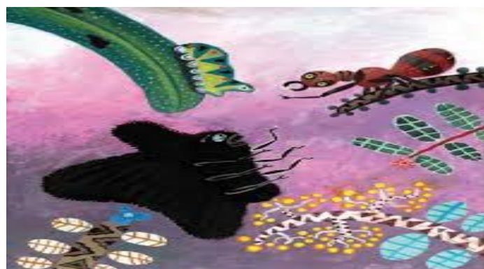
Figure 5 Opening 9 of The Proud Butterfly and the Strange Tree (Jainal Amambing, 2011)

The affiliation between the characters changes towards the end of the story. For instance, in opening 10, the visual shows the butterfly and the tree are on equal footing in terms of power as the angle is at eye-level. In terms of proximity, the butterfly is close to the tree as it is sitting on the branch. The butterfly's linguistic choices of plea in the written text resonates with the visual information and proves that it wants to be friends with the tree. In the final opening, the visual mode shows that in terms of proximity, the butterfly and the tree are affiliated as they are depicted closely together. However, in terms of cohesion, there is divergence in meaning as this information is not evident textually. In brief, the visual mode commits more information about the relationship between characters compared to the